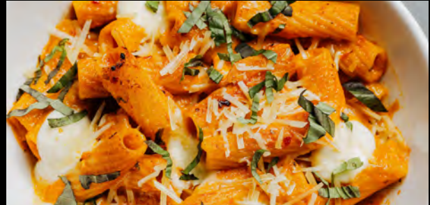
RIGATONI VODKA $60

(serves 12-15) our version of the classic