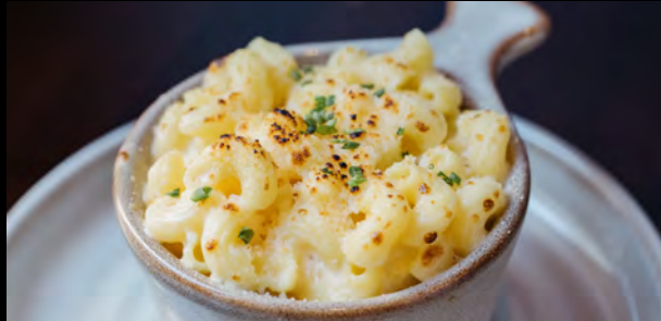
MAC + CHEESE $40

(serves 12-15) our version of the classic